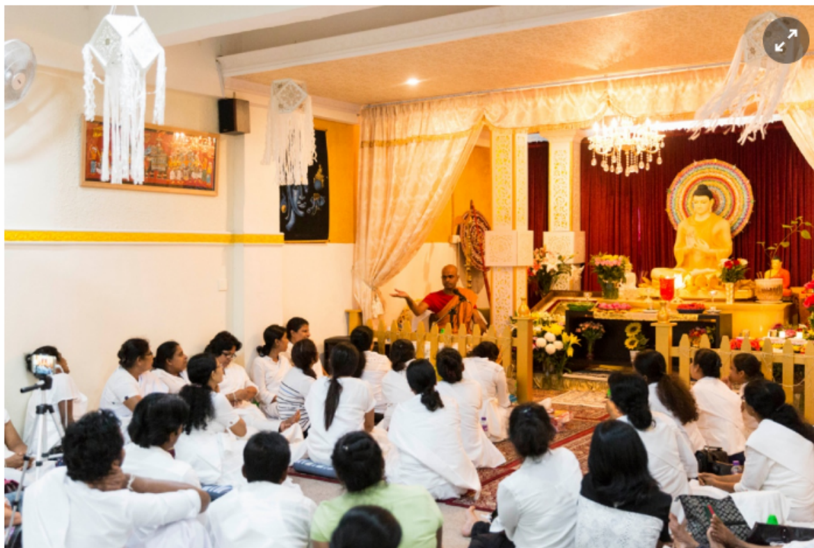
Now they can only squeeze in the small Buddhist center lectures, decoration is their own to do. (Gong Huisuo)